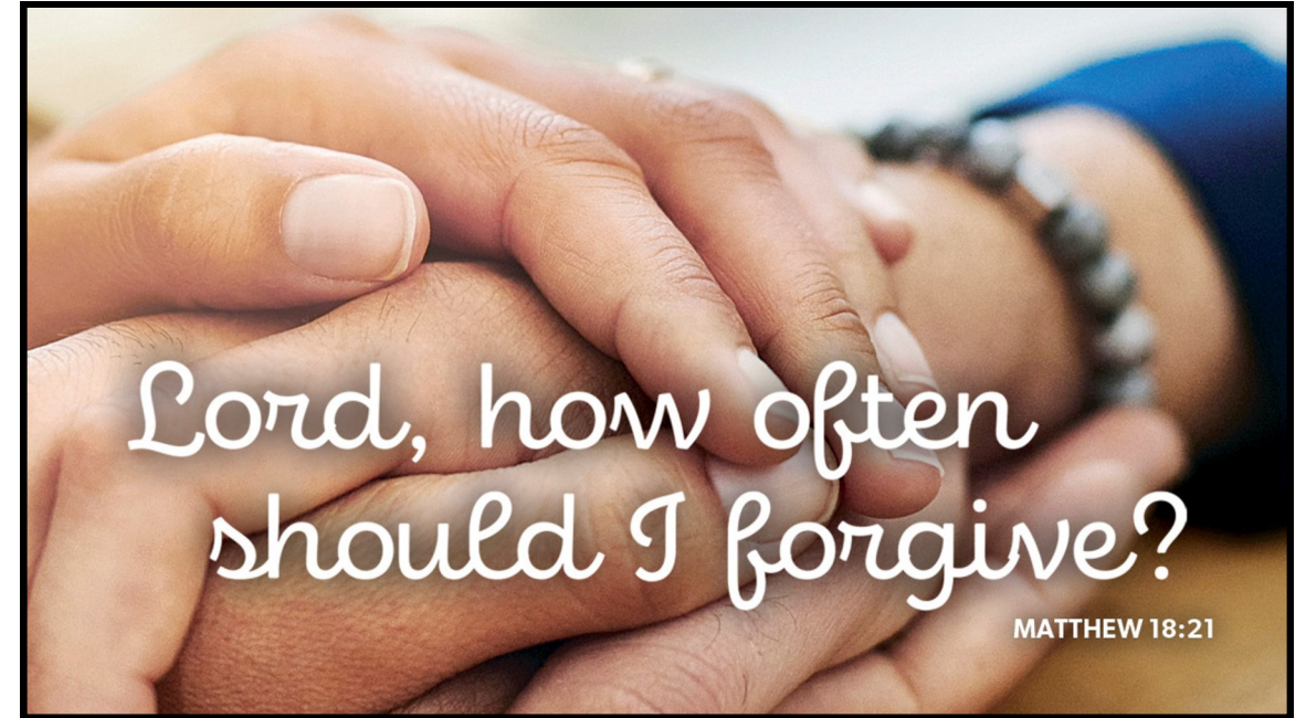
Image: Clasped hands. © PeopleImages/iStock/Getty Images Plus via Getty Images. Used by permission.